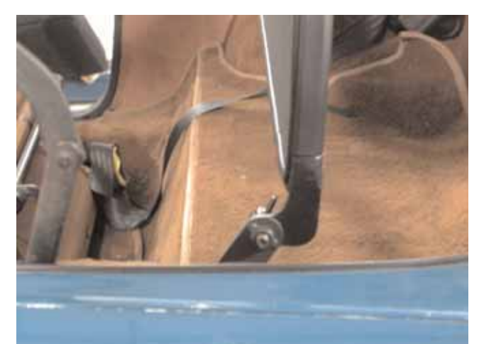
Illustration 3 cont.