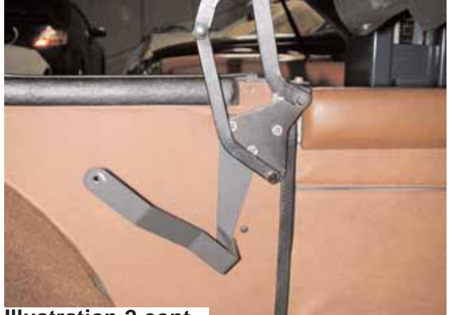
Illustration 2 cont.

3) Gather the wing bolts, all the washers and the wind blocker. Install one of the metal flat washers and one of the fiber washers onto each wing bolt. Position the wind blocker in the car so that the Lbrackets on the bottom corners of the wind blocker point forward. This will give the seats the most room. Slip a fiber washer between the L-brackets on the blocker and the wind blocker brackets installed in the previous step. Install the wing bolts with the washers on, through the L-brackets and into the wind blocker brackets. Adjust the brackets as necessary and tighten the three screws on each convertible top bracket. Now adjust the wind blocker as you see fit and tighten the wing bolts to hold it in position. Illustration 3.