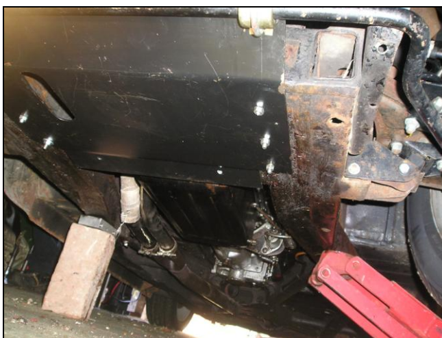
Fig 4: Radiator Shield in position.