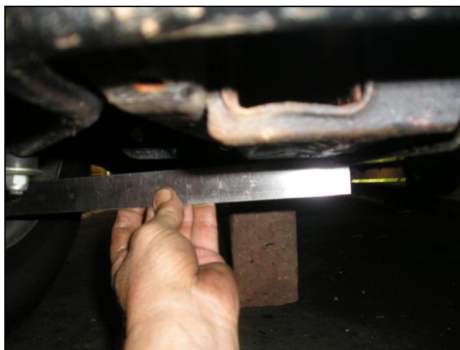
Fig: 2 Position radiator shield