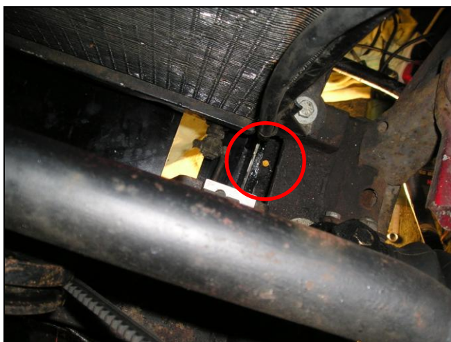
Fig 3: Fixing hole in chassis leg flange